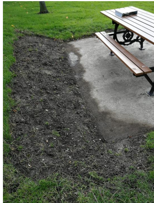
CTT has sowed grass seed on various bald patches on the green recently to repair wear around the adult exercise machines, and in the vicinity of the new picnic benches.