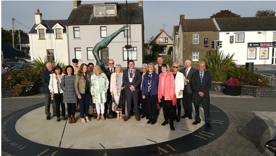
Congratulations to our friends in Blackrock who won the award for Ireland's Tidiest Small Town 2019.