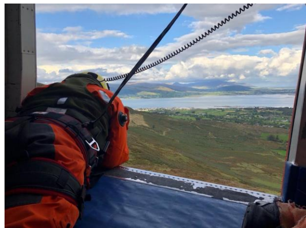
Irish Coastguard Rescue 116 conducting CALs (a confined area landing) in the Cooley Mountains. Stay safe and thanks for all you do.