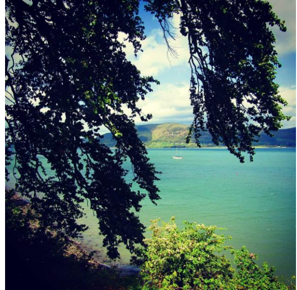
Tranquil views from the grounds of King John's Castle