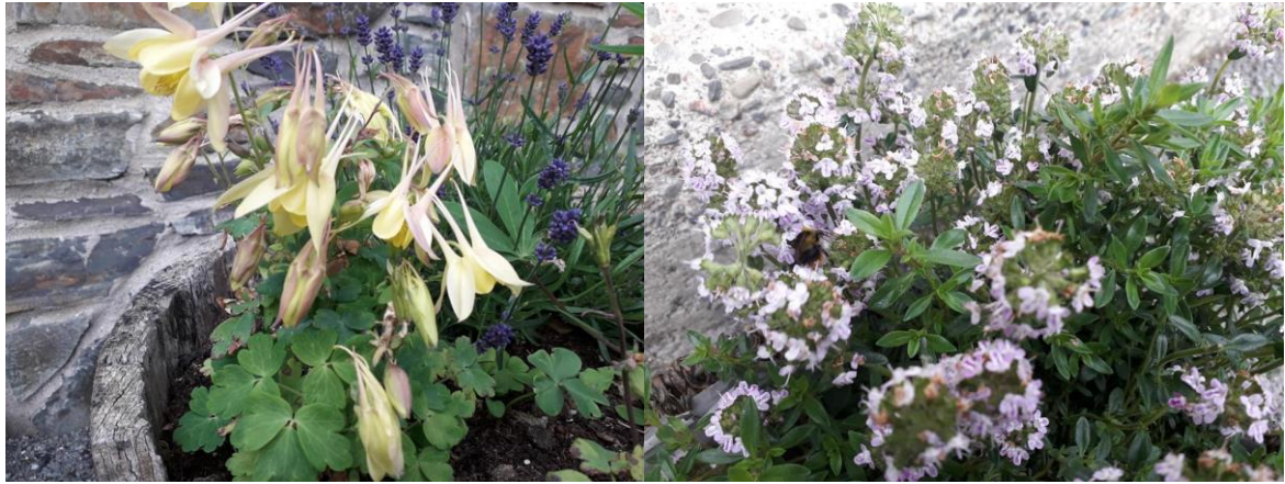
Just a few of the pollinating bee friendly plants we are installing this year instead of the previous range of bedding plants.