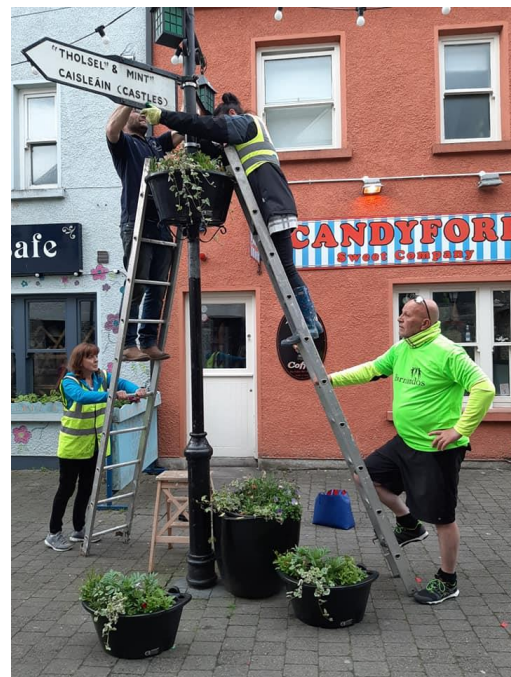
Home grown hanging baskets brought to you by Carlingford Tidy Towns and installed by our team.