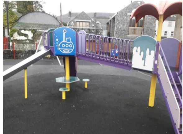
Thank you, Louth County Council. We love the addition of these toadstools in the children's playground. CTT decided to do a bit of work there too by repainting the yellow poles supporting the bridge above and also refreshing the one in the pictures below.