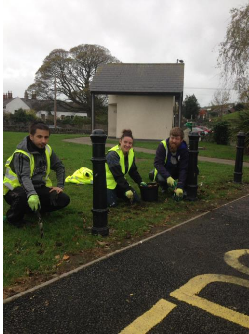
CTT together with our TUS workers planted up the edge of the green with narcissus bulbs recently, hoping for a nice display in the spring.