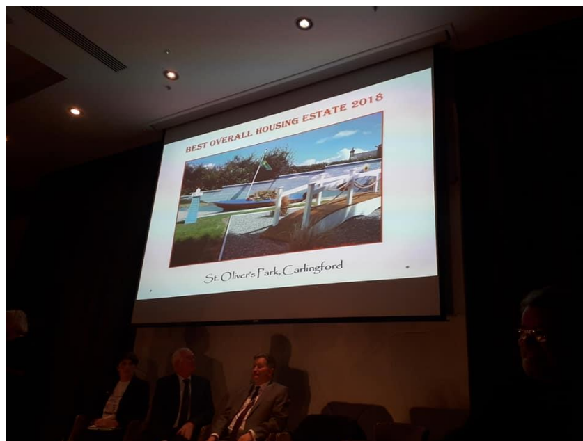
St Oliver's Park won the award of Best Overall Housing Estate 2018 for their addition of a new seascape feature on their estate. Such a credit to all involved.

Well done to Carlingford Tidy Towns and sponsor Carlingford Accommodation on the installation of a new hi-tech litter bin.