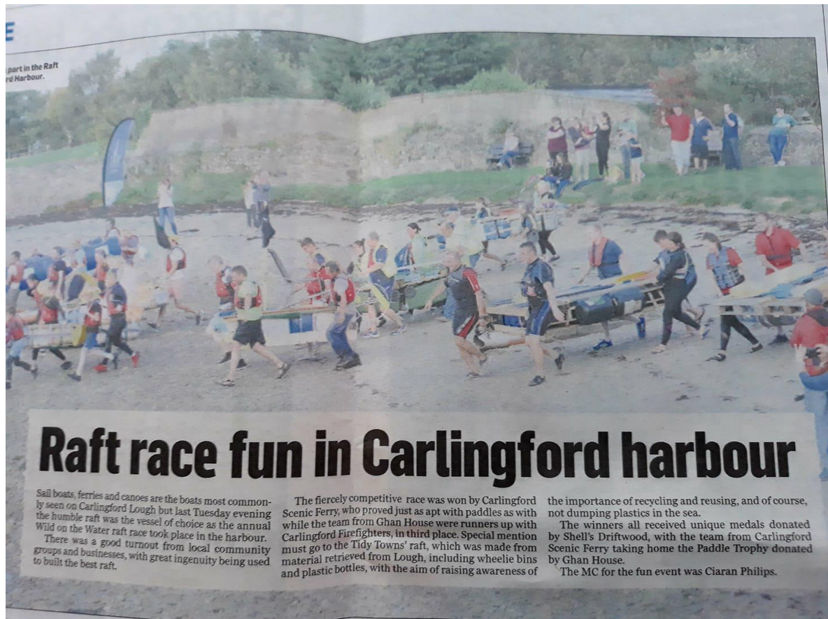
The start of the Carlingford Raft Race was captured by the Argus and although we didn't do very well actually rowing our unwieldy craft, we got a mention for its waste management credentials!