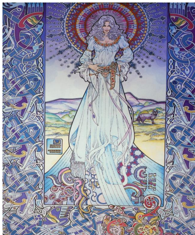
THE BEAUTY OF CELTIC ART