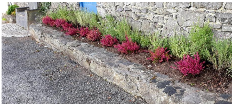
Seamus planted up this extremely dry area near the Blue Door on castle pier with pollinator friendly heather and lavender. We think these Mediterranean plants are more likely to tolerate the dry conditions at this location.