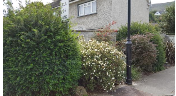
The first pair of photographs show the entrance to Trinity Close before our TUS workers undertook some heavy-duty trimming.