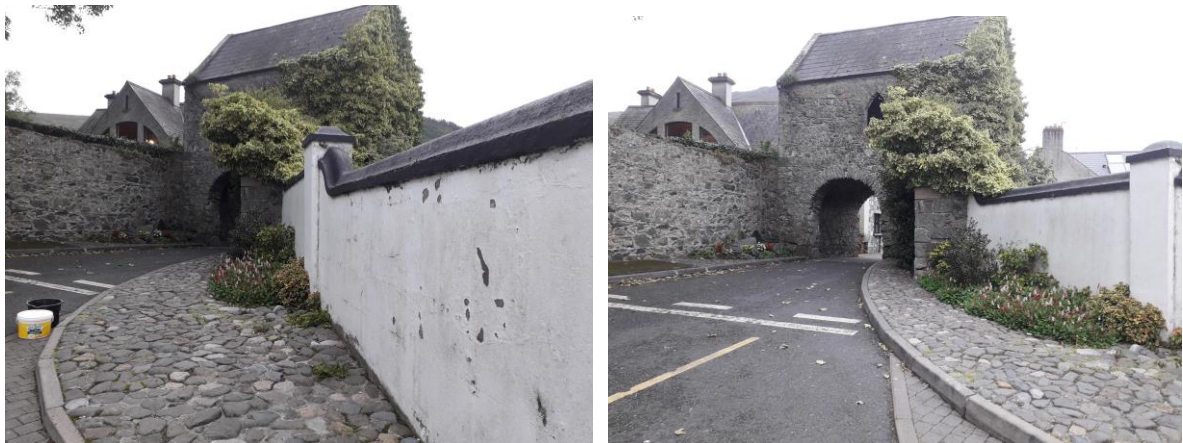
After seeking permission, we spruced up a section of the wall near Tholsel Gate.