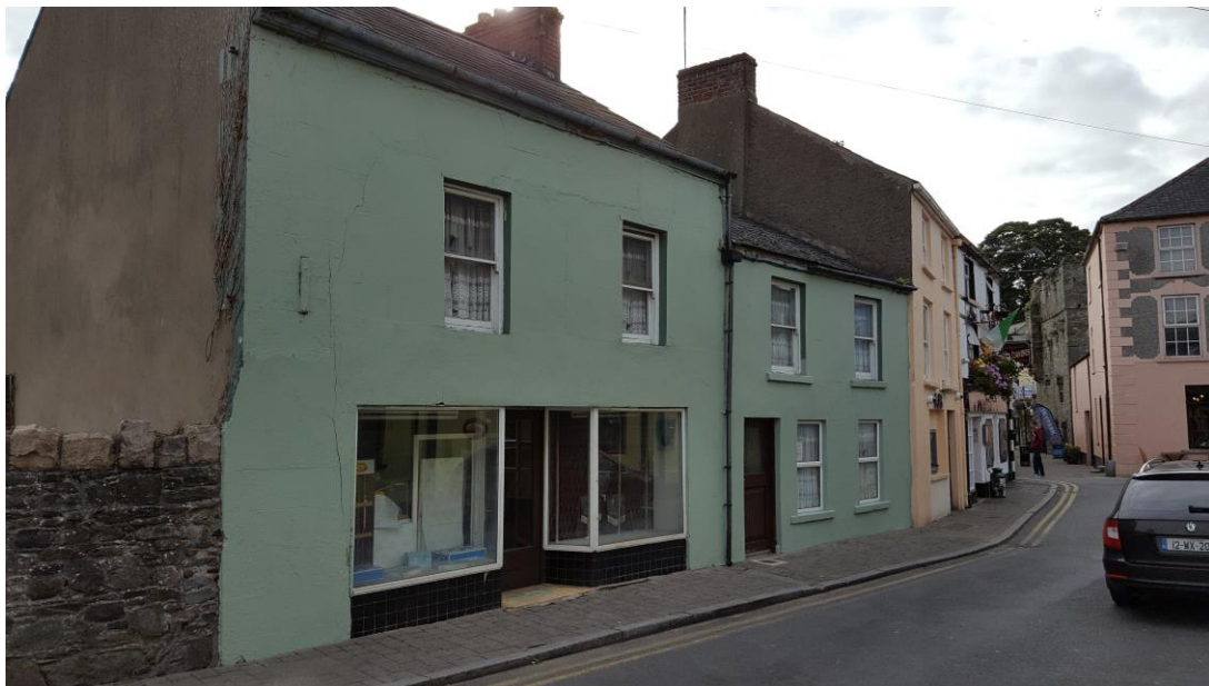
We are delighted to report that the disused shop front adjacent to the ATM machine has received a fresh coat of paint in recent weeks as the before and after photos affirm.