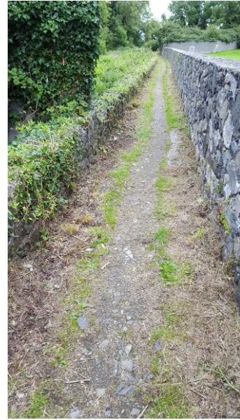
They went on to trim Mill Dam Lane from the old mill all the way round to Dundalk Street making access for school children and the public very much easier.