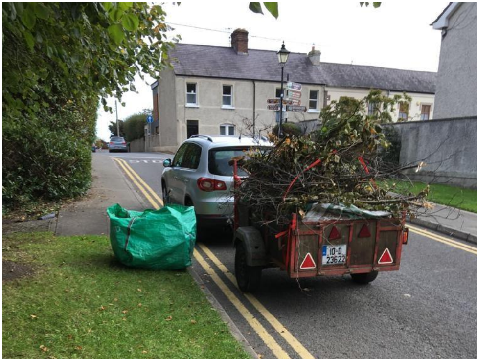
Note: Gerry constantly transports tonnes of green waste material to the council depot all year round, a service for which we are eternally grateful!