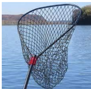
We would like to thank the Carlingford Open Water Swimmers group and Ferdia who are doing their bit to clean up litter in the harbour using their own recently purchased fishing net.