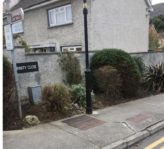
The pair of photos above show the results after a few hours labour from our growing team of TUS workers (now 4) plus Noel Fretwell.